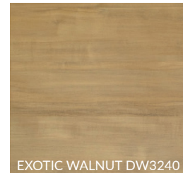
EXOTIC WALNUT DW3240